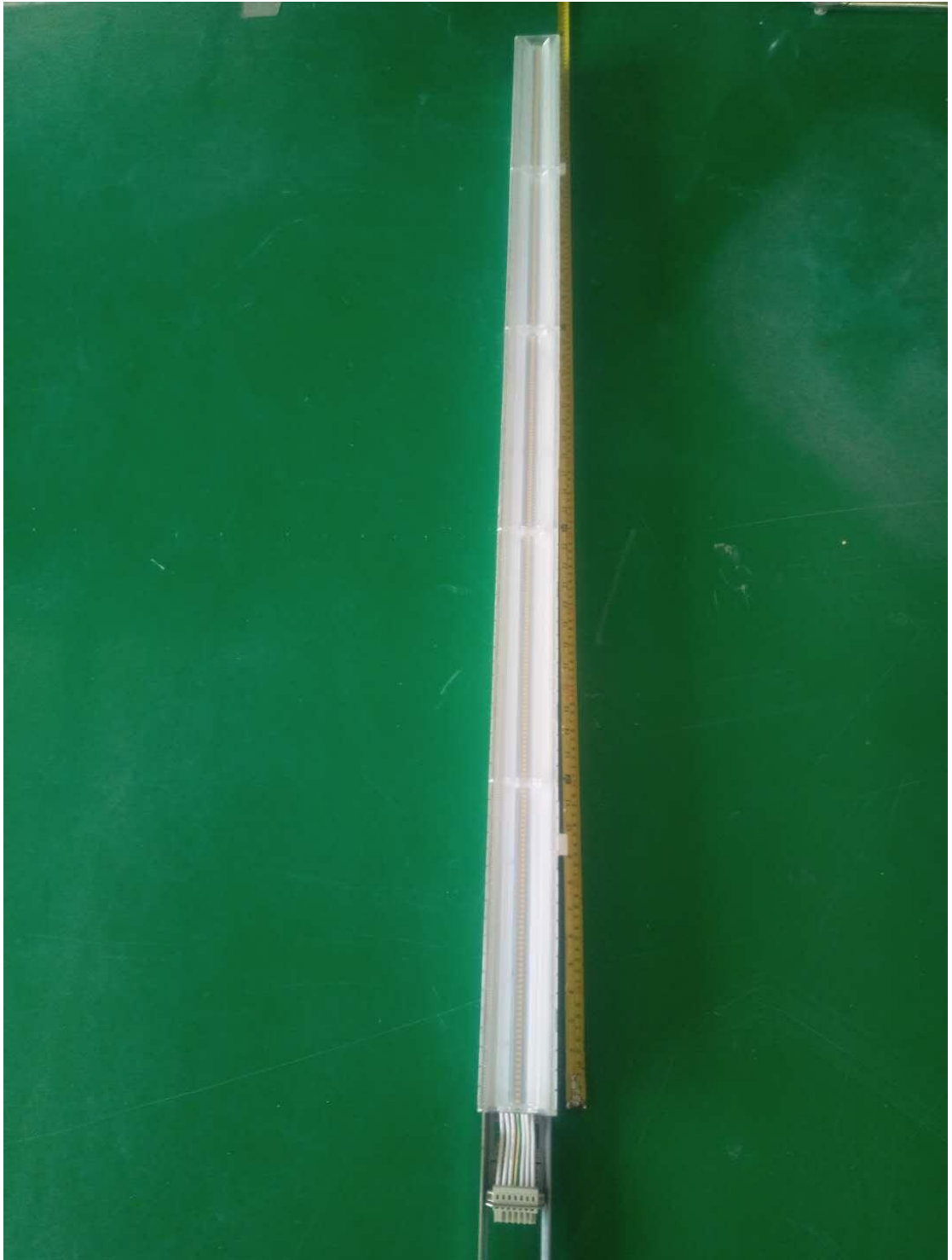
Photo 1 General appearance of the EUT